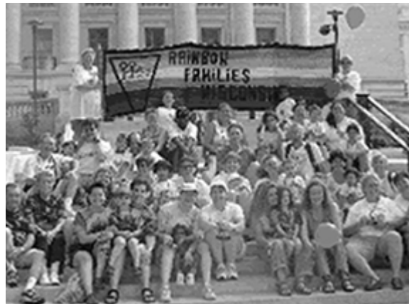
Rainbow Families Wisconsin on the capitol steps at the LGBT Pride march in July 2001. RFW presence was covered by statewide television and newspapers.

spring conference. Last year's day-long conference in Madison included a keynote speaker and eight break-out sessions on such topics as: protecting our families under the law, navigating your child's school, a panel of teens from LGBT families, and cutting edge issues in queer parenting. The conference was filled with more than 100 adults and 30 children. Planning is underway for this year's conference in Milwaukee on May 17.